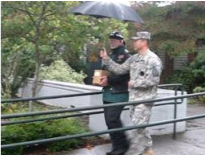
Carrying remains from Coroner's Office.