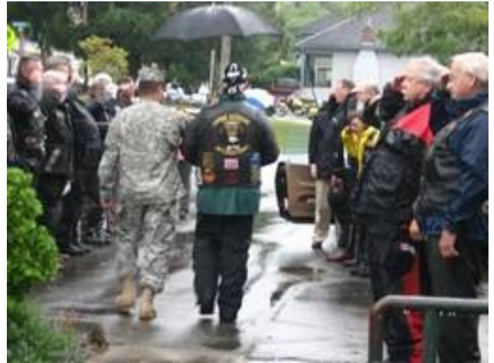
Carrying remains from Coroner's Office.