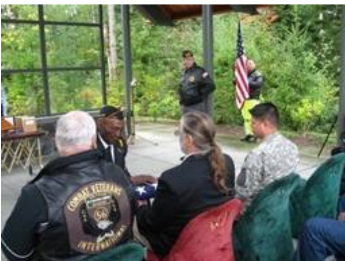
Completion of services.